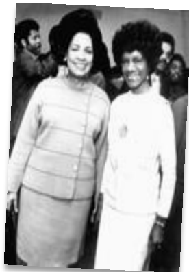
Gwendolyn Sawyer Cherry, Esq. with Congresswoman Shirley Chisholm

In 2005, the association voted to be renamed in honor of community activist Gwendolyn Sawyer Cherry , who was the first Black female attorney to practice in Dade County, and the first Black female legislator in the State of Florida. Throughout the association's existence, it has grown and its reach has expanded. Although it began as a Dade County bar association, GSCBWL currently represents over 350 men and women law students, lawyers and judges throughout the State of Florida.