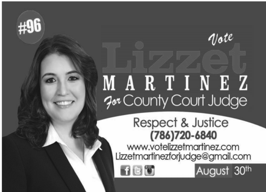
Paid Political Advertisement